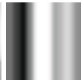
Mirror- Polished Stainless Steel