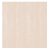
Beach Club Teak