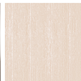
Beach Club Teak